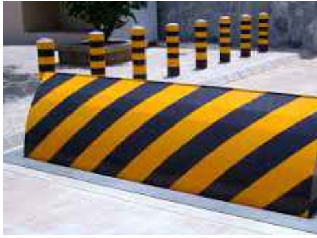
HYDRAULIC ROAD BLOCKER