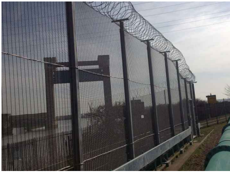
ANTI CLIMB FENCE