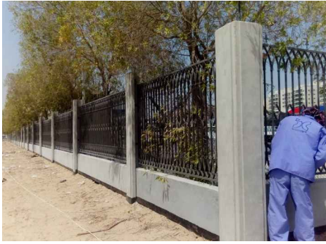
BOUNDARY WALL FENCE