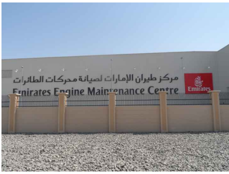
BOUNDARY WALL FENCE