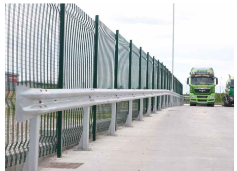
CRASH RATED FENCE SYSTEMS