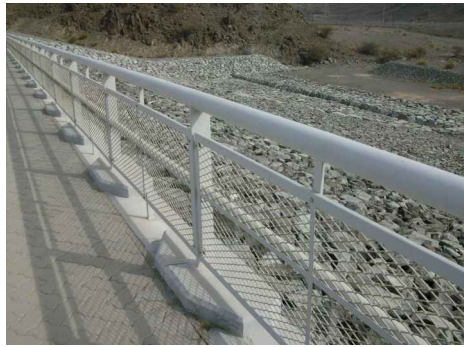
EXPANDED MESH FENCE