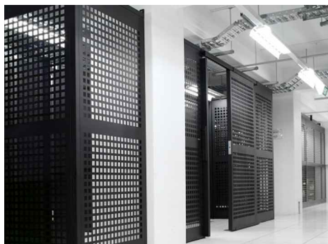
SERVER ROOM CAGES