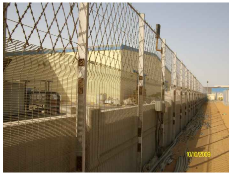
ANTI CLIMB RAZOR FENCE