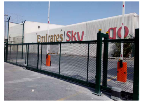
TELESCOPIC SLIDING GATE