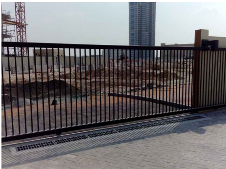
STEEL SLIDING GATE