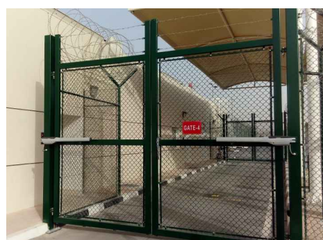
AUTOMATIC SWING GATE