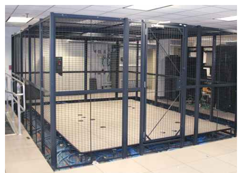
DATA CENTER SECURITY CAGES