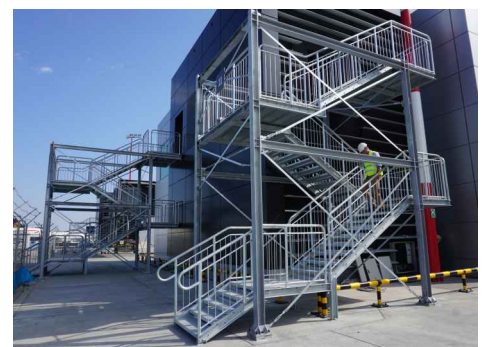
METAL STAIRS CASE