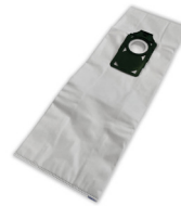
HEPA MEDIA BAGS